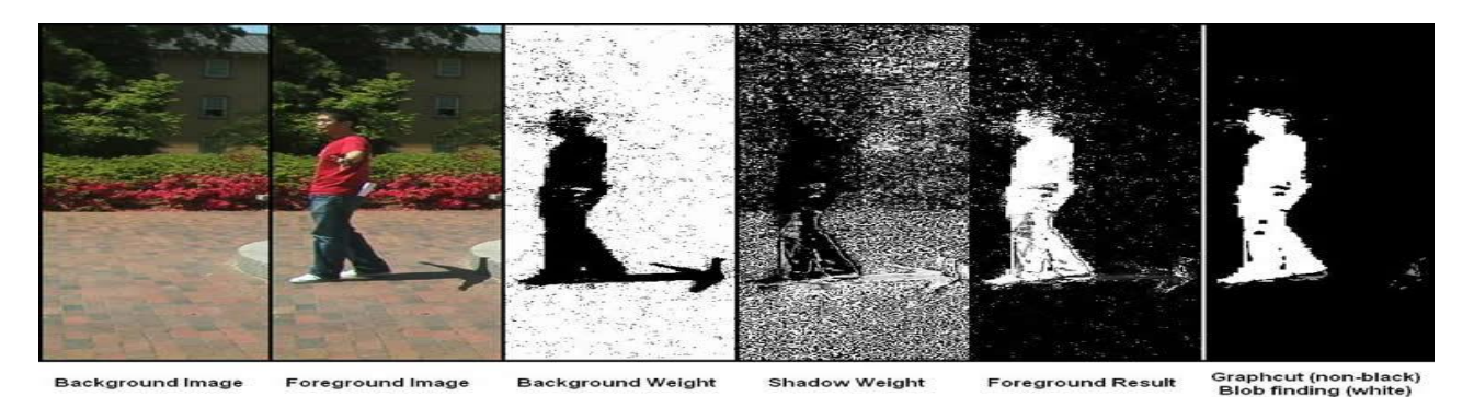
Figure 4. Background subtraction techniques